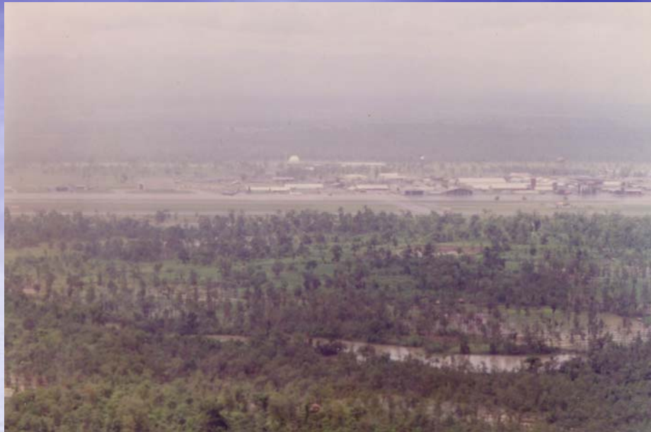
View from the air