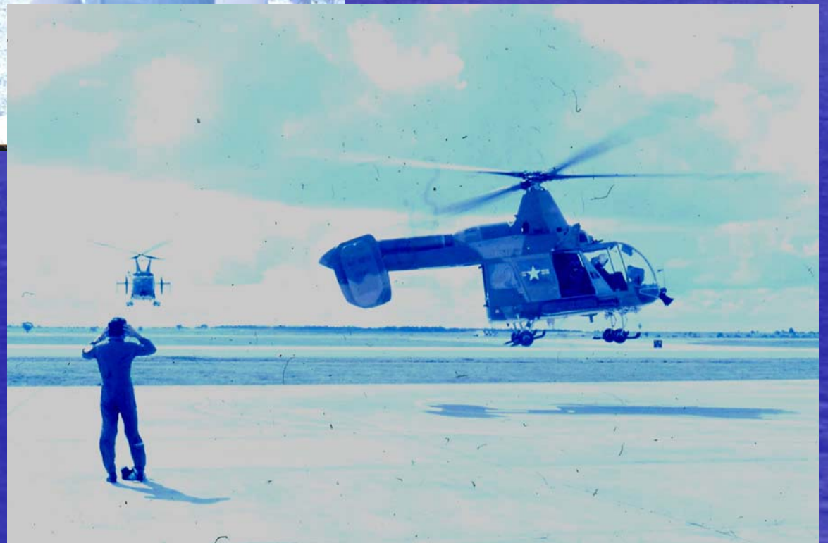
Returned to Utapao via HH-43