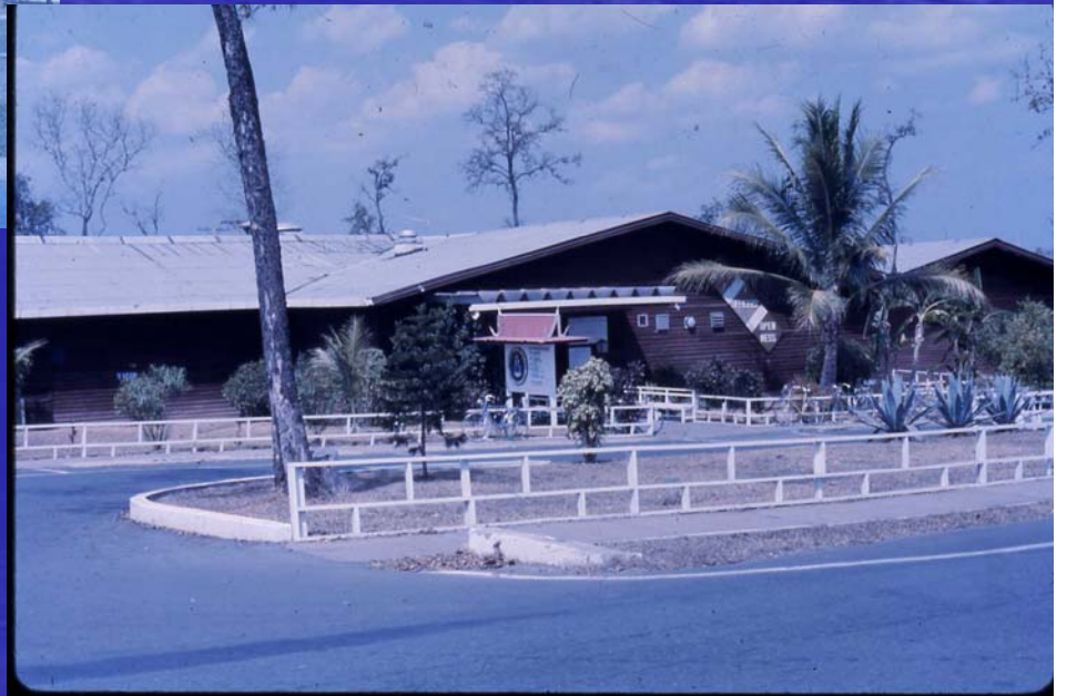
Officer's Open Mess