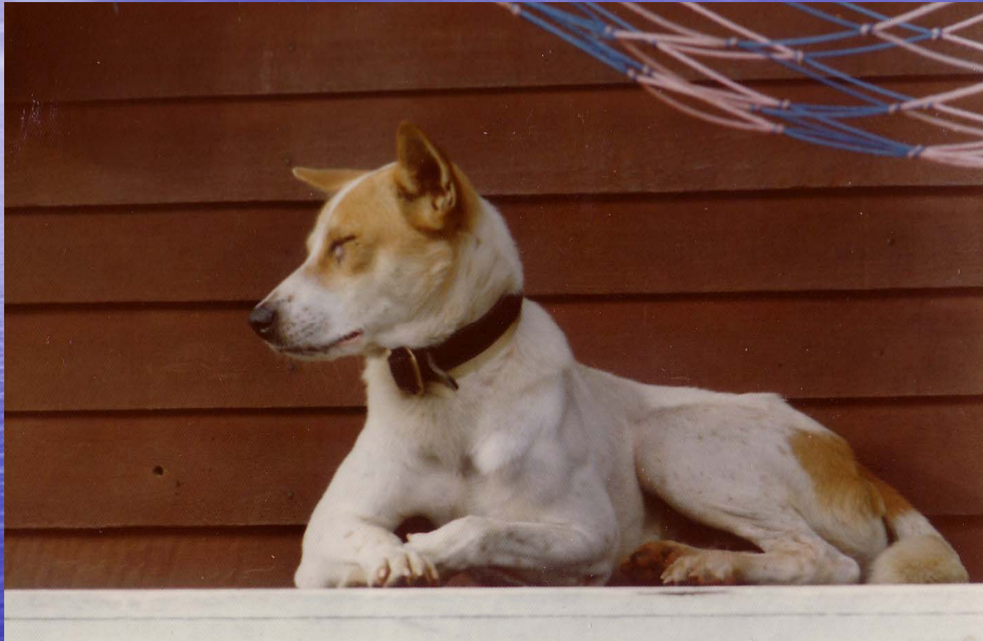
Our Mascot "Dusty"