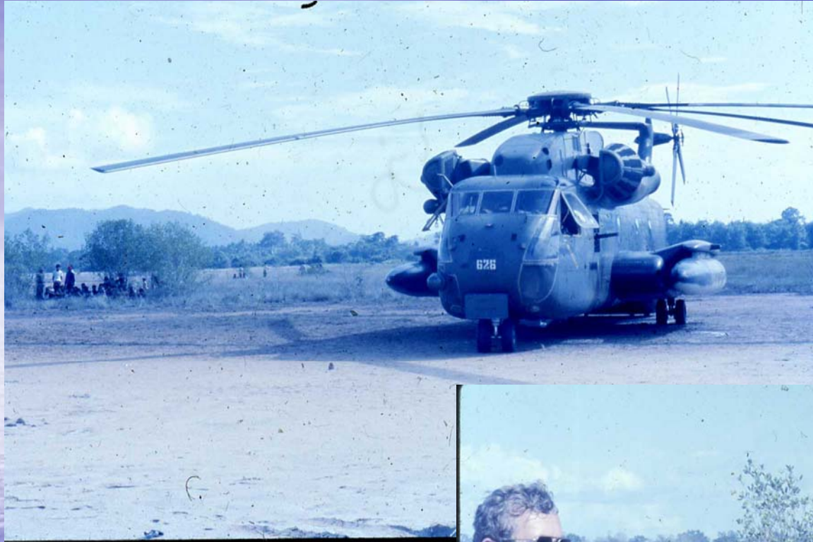
Knife 52 waiting for fuel