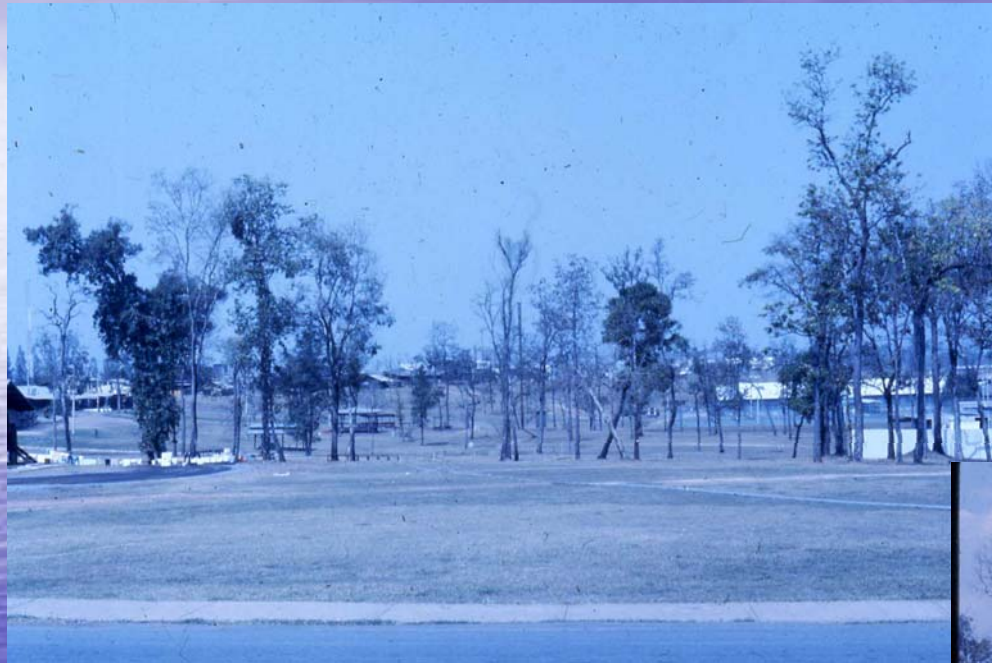
View from Officer's Quarters