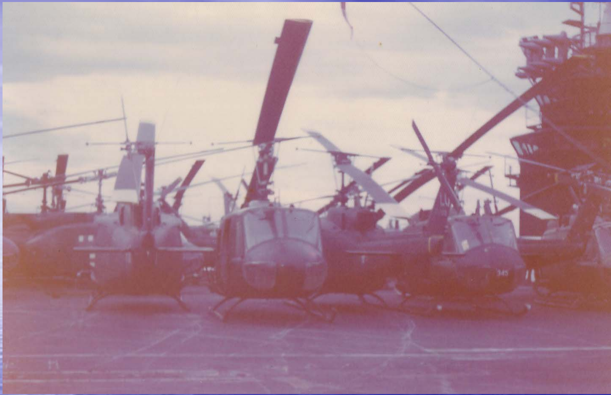
Vietnamese UH-1s, nose to tail