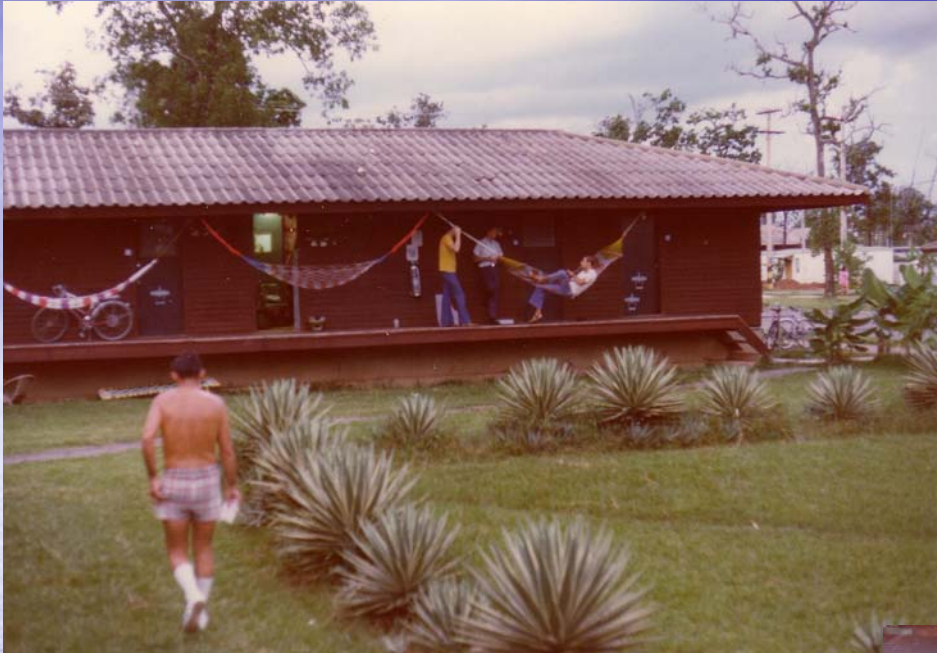
21 st SOS Officer's Hooch