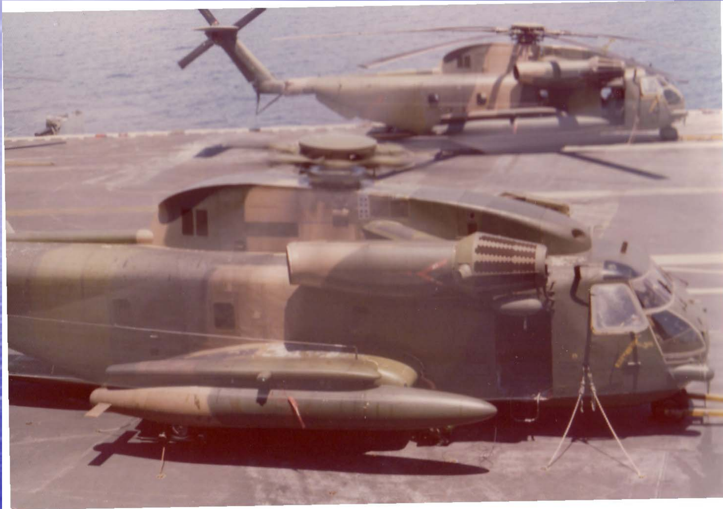
Safe on Deck USS Midway