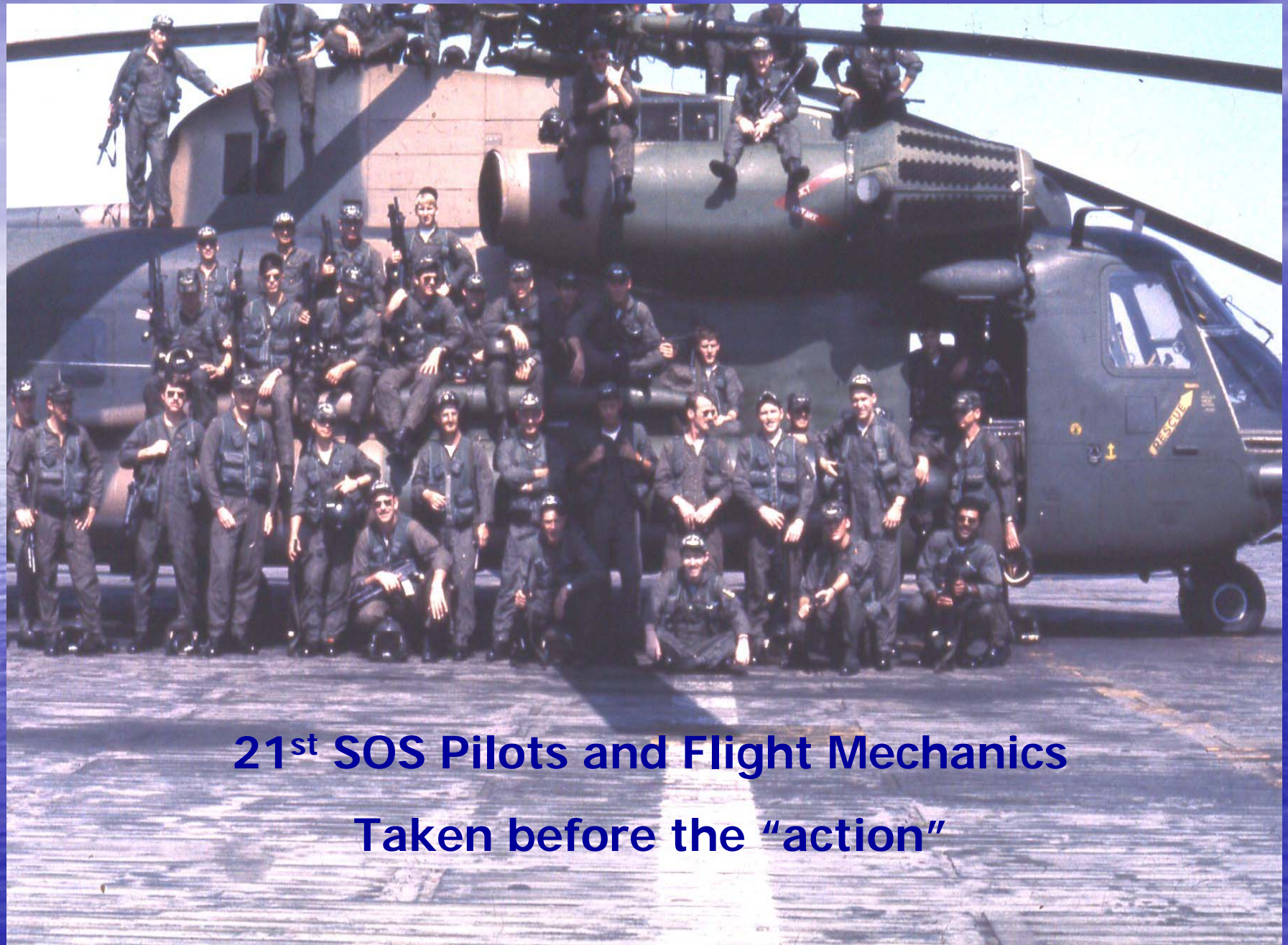
21 st SOS Pilots and Flight Mechanics Taken before the "action"