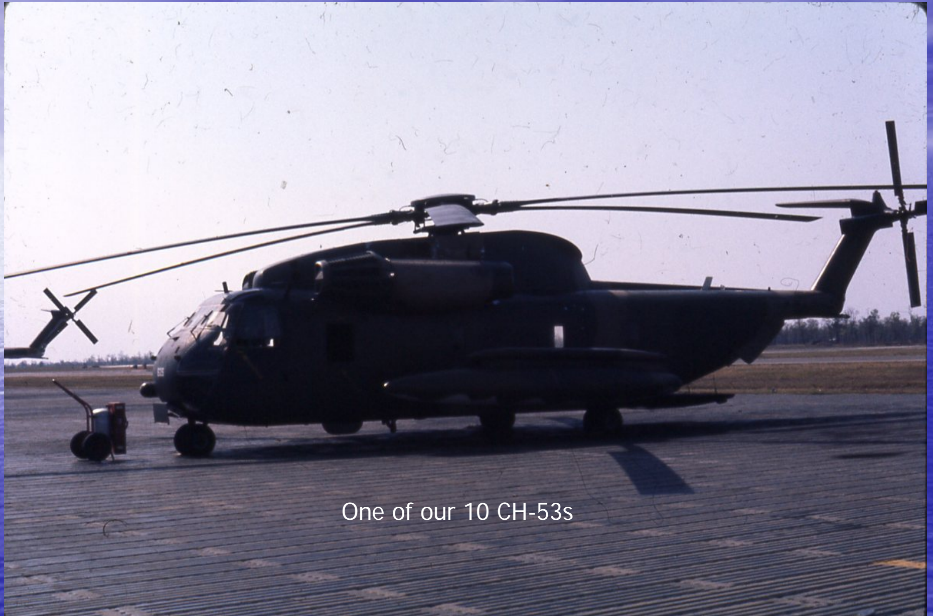
One of our 10 CH-53s